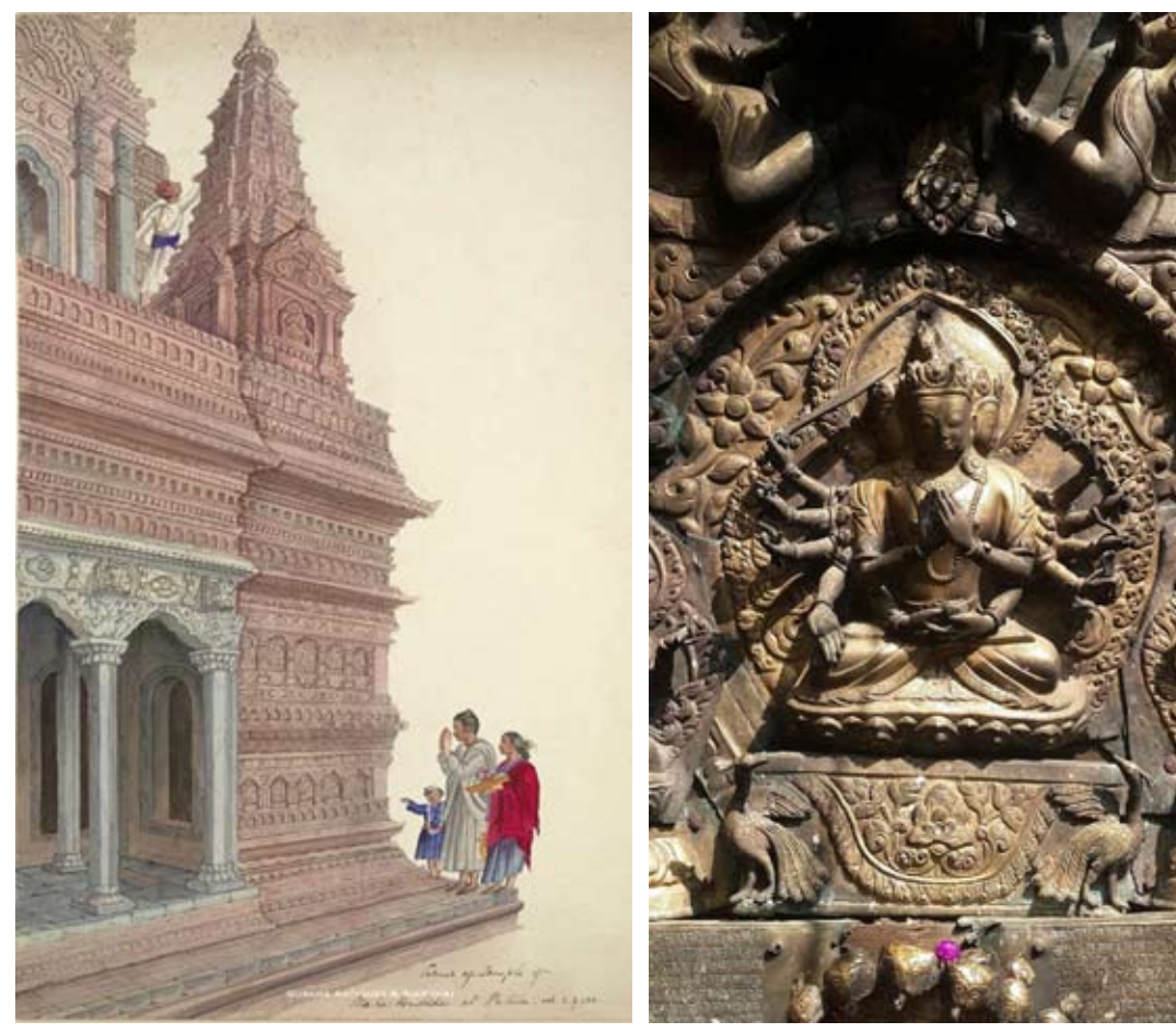
Ill 6. "Corner of Temple of Maha-Buddha at Patun", H. A. Oldfield, 1850s<sup>40</sup>